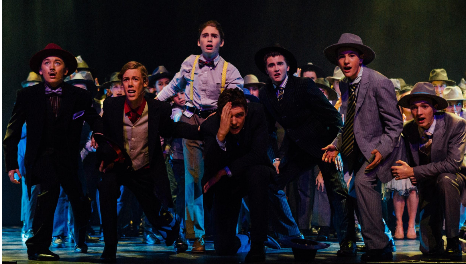
Guys and Dolls 2019 at NIDA